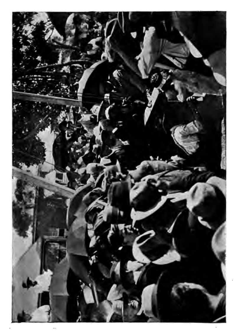
LAYING FOUNDATION STONE OF SPIRITUALIST CHURCH AT BRISBANE.